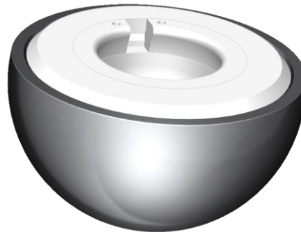
Figure 1: Bipolar Head