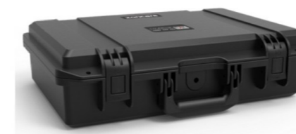
Optional waterproof and pressure-proof suitcase

The suitcase is based on a compact and lightweight design that can be easily carried out